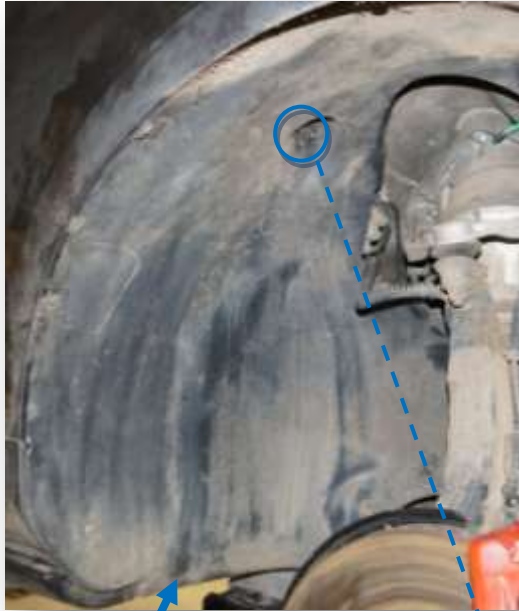
Hidden T30 torx